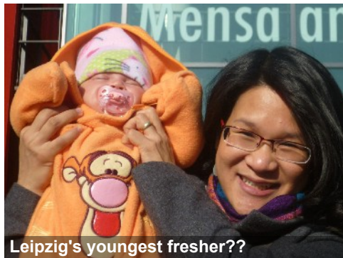
Leipzig's youngest fresher??

The title and the picture are obviously a bit misleading – if you were expecting something about Miranda then you'll have